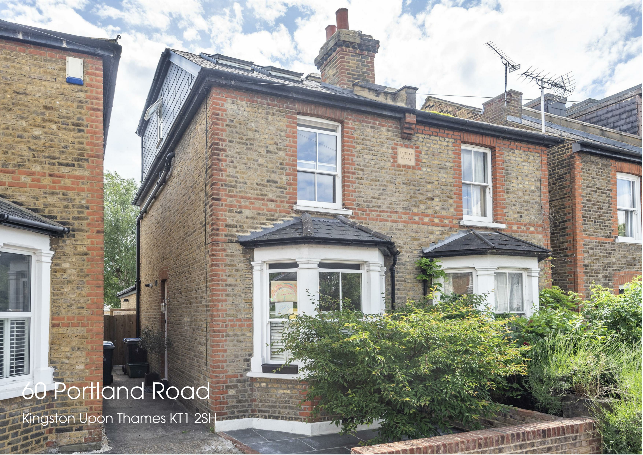
60 Portland Road Kingston Upon Thames KT1 2SH

34 Richmond Road Kingston upon Thames Surrey KT2 5ED www.gibsonlane.co.uk Tel: 020 8546 5444